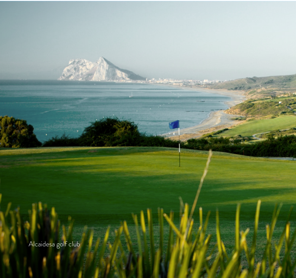
Alcaidesa golf club