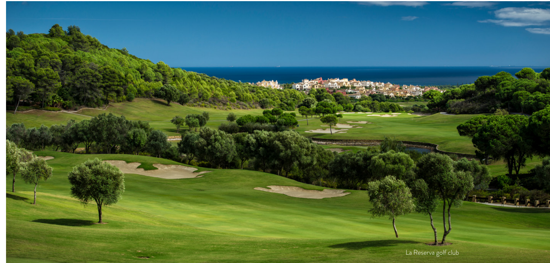
La Reserva golf club