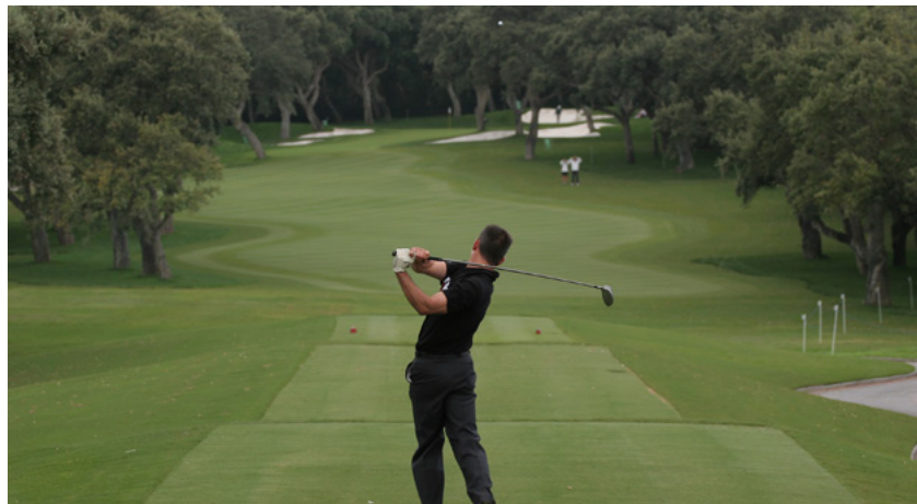
Real club de golf Valderrama