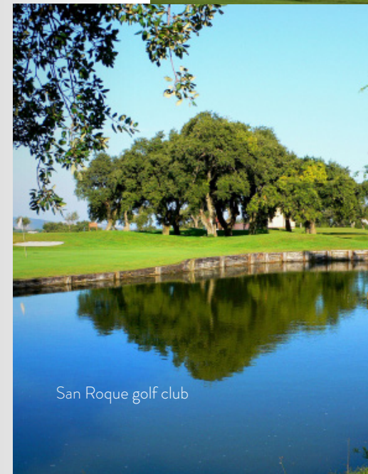
San Roque golf club

La Reserva Club in Sotogrande is just 5 minutes away and has many facilities on offer including the Golf Course, Horse Riding and the original 'The Beach', a fantastic resort beside the Golf Course which includes a restaurant, white sandy beach and lagoon for sports activities etc.