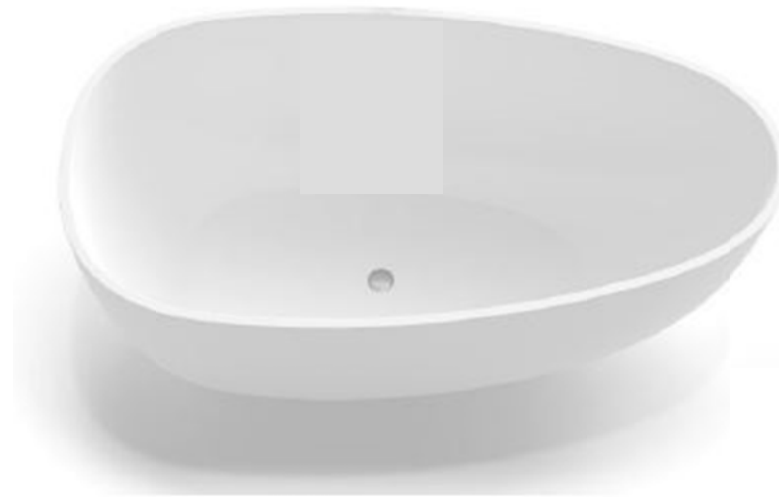
Non-binding figurative image

170 x 88 cm freestanding bathtub with floor-mounted tap.