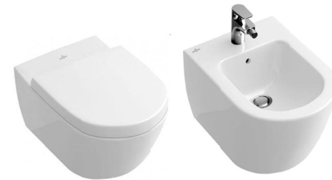
Non-binding figurative taps.

Wall-hung toilet with built-in cistern in enclosure with half and full flush button, cushioned seat and cover. Villeroy Boch SUBWAY 2.0 model, in all bathrooms and toilet. Bidet of the same model in master bathroom.